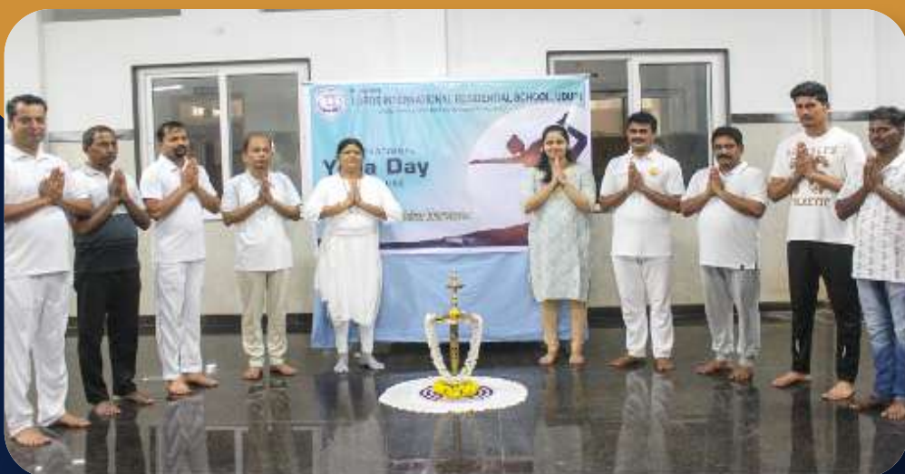
International Yoga Day Celebrations At LORDS