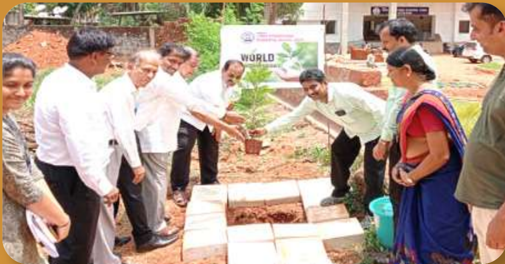
World Environment Day - 2023