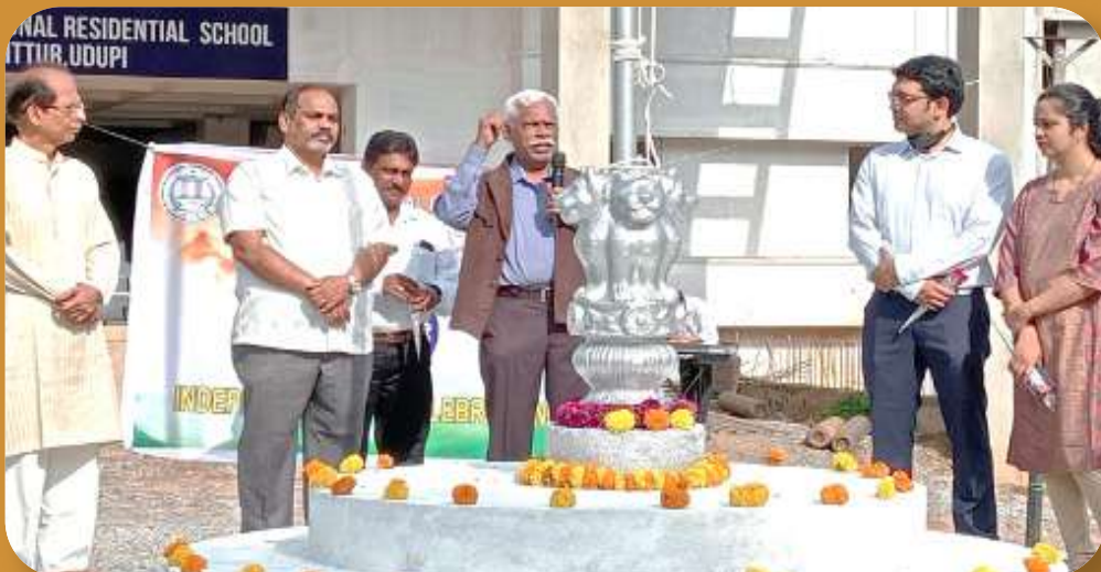
77th Independence Day Celebrations At LORDS Campus